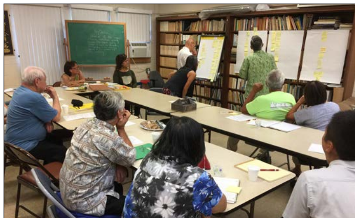
Members gathered after Sunday service to categorize ideas brought up in brainstorming to help the Betsuin focus on ways the temple might be able to better position itself for the future.