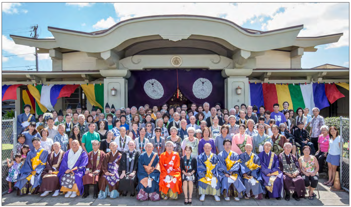
Souvenir photo of officiants, members and guests at the Hawaii District Goenki service held on Sunday, Nov. 6, at the Betsuin.

people from other Oahu temples, neighbor islands, U. S. mainland, South America and Japan.